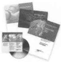
FM 4991 contractors are listed in FM directories, and at www.fcia.org .

These inspection standards incorporate the following important points as part of the inspection protocol: