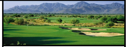
The Talking Stick Golf Club, designed by Bill Coore and Ben Crenshaw, was recently recognized by Golfweek magazine as being one of the Top Public Golf Courses. TSGC boasts two distinct golf courses, offering your choice of a links style adventure or a tree-lined fairway outing.

*Golf club rental available, plus 20% discount off golf ball purchase in the Pro Shop. (Taylor Made XL DR Rental Clubs.)