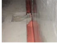
Perimeter Curtain Wall