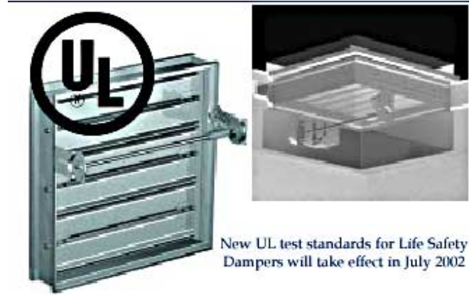
New UL test standards for Life Safety Dampers will take effect in July 2002