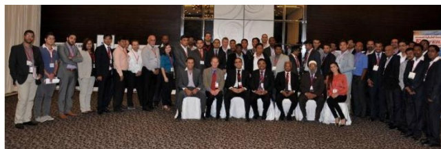
Attendees at 2012 Dubai, UAE FCIA DIIM Educational Symposium

FCIA visits Abu Dhabi again March 24 at The Yas Hotel. We look forward to presenting new firestopping and effective compartmentation information to the FCIA Membership and Departments of Civil Defence, Municipal Affairs and other consultants and design professionals. FCIA, FM & UL Firestop Education, FM 4991 Approved and UL Qualified Firestop Contractor Exams take place March 25.