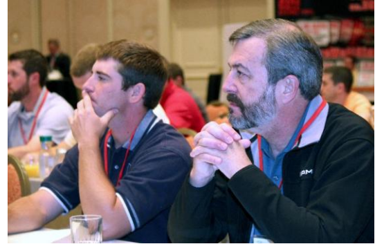
FCIA Members listening in at the Orlando conference

the performance of installed firestopping for fire and life safety in buildings.