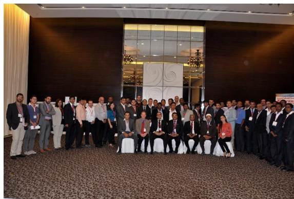
Attendees at FCIA's Middle East Seminar

FCIA's International efforts continue. After a successful 2012 Firestopping & DIIM program in Dubai, FCIA is speaking in Muscat, Oman April 2&3. FCIA's Seminars in the Middle East continue with a program both in Abu Dhabi, UAE and Doha, Qatar planned as well.