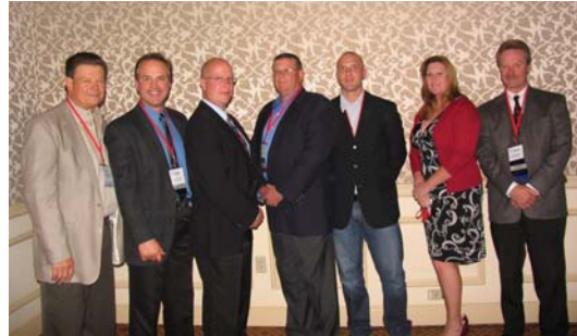
FCIA's 2009 Board of Directors