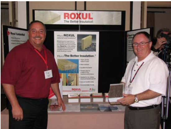
FCIA Tabletop participant, ROXUL