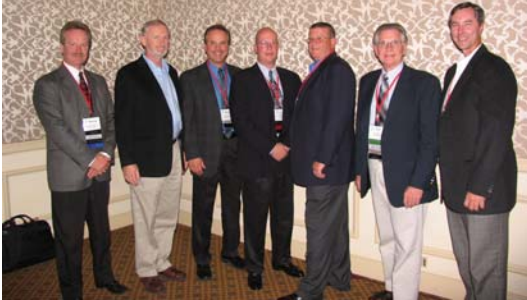
FCIA's 2008 Board of Directors