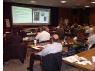
FCIA & UL at ICC LA Basin Chapter

FCIA Members, bring a building official, fire marshal or specifier guest, and you can come too. For info, visit the UL Qualification page at http://www.fcia.org .