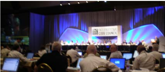
FCIA hit the big screen at the ICC Hearings

Look for a full report at the FCIA website in the next few weeks.